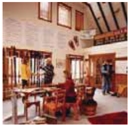
Mt. Hood Cultural Center Museum Government Camp