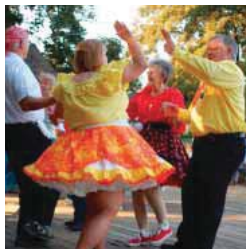
Square Dancers Philip Foster Farms Eagle Creek