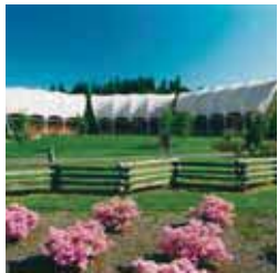
End of the Oregon Trail Interpretive Center Oregon City