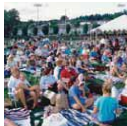
Summer Concert Series Lake Oswego