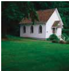
Pioneer Church Carver

A treasure trove of ideas, experiences and teachings shape and inspire individuals and families to participate and join in civic engagement throughout their lives