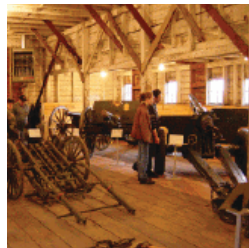
Oregon Military Museum Barn Camp Withycombe Clackamas