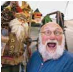
Crafts Booth Lake Oswego Festival of the Arts

Education is the key. We have to integrate arts and culture into education; somehow formulate a K-12 curriculum that hooks people at an early age. The real impact is generational. An adult looking back will remember the theater production they were in, or a field trip to the museum.