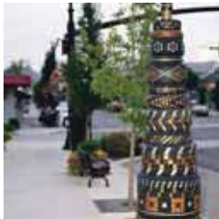
Gallery Without Walls Lake Oswego

Our "culture" is the sum of the places and activities in our lives that define who we are...our heritage, our arts, our parks and wilderness areas, our many festivals, all our rivers and the various other elements in our communities which we love and would not want to do without.