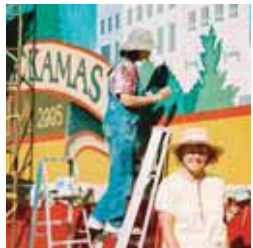
ArtBack's Mural in a Weekend Estacada

Education is the key. We have to integrate arts and culture into education; somehow formulate a K-12 curriculum that hooks people at an early age. The real impact is generational. An adult looking back will remember the theater production they were in, or a field trip to the museum.