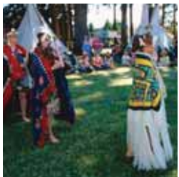
Native American Dance Clackamas County Fair Canby

It's important that we don't lose sight of the real mission - to increase livability.