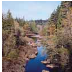
Sandy River Crossing