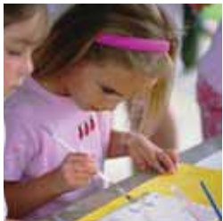
Hands-on Artmaking Clackamas County